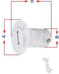
Art. n° 8110 Tappo imbarco gasolio Fuel deck filler