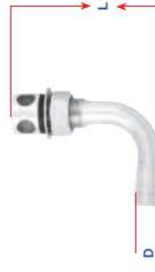
Art. n° 8287 Sfiato serbatoio 90° Tank vent 90°