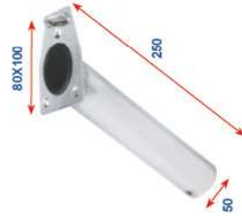
Art. n° 8149 Portacanna ad incasso 45° Fishing rod holder 45°