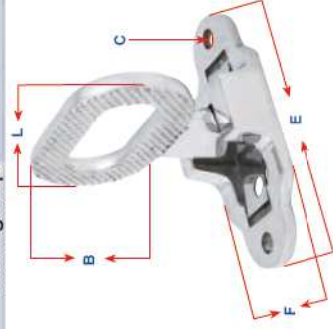
Art. n° 8244 Gradino a chiusura in microfusione Folding step