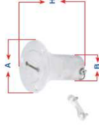
Art. n° 8109 Tappo imbarco acqua Water deck filler