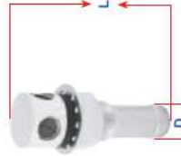
Art. n° 8286 Sfiato serbatoio Tank vent