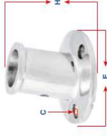
Art. n° 8283 Portabandiera microfusione 84° Flag pole base, deck mount. 84°, inv. cast, polished