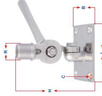
Art. n° 8279 Base antenna in microfusione Antenna base with 2mm EPDM seal (sea-water resistant) screws, self locking nut and washer, investment cast