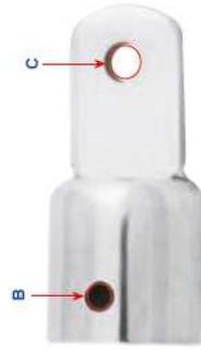
Art. n° 8139 Bicchierino per snodo tendalini Top cap joint for awnings boat