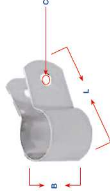
Art. n° 8138 Fascetta per snodo tendalini Clamp hub awnings