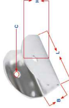
Art. n° 8134 Supporto a parete per scaletta Wall bracket for ladder