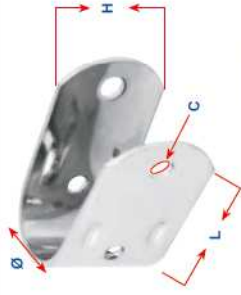
Art. n° 8135 Fascetta per snodo scaletta Clamp joint ladder